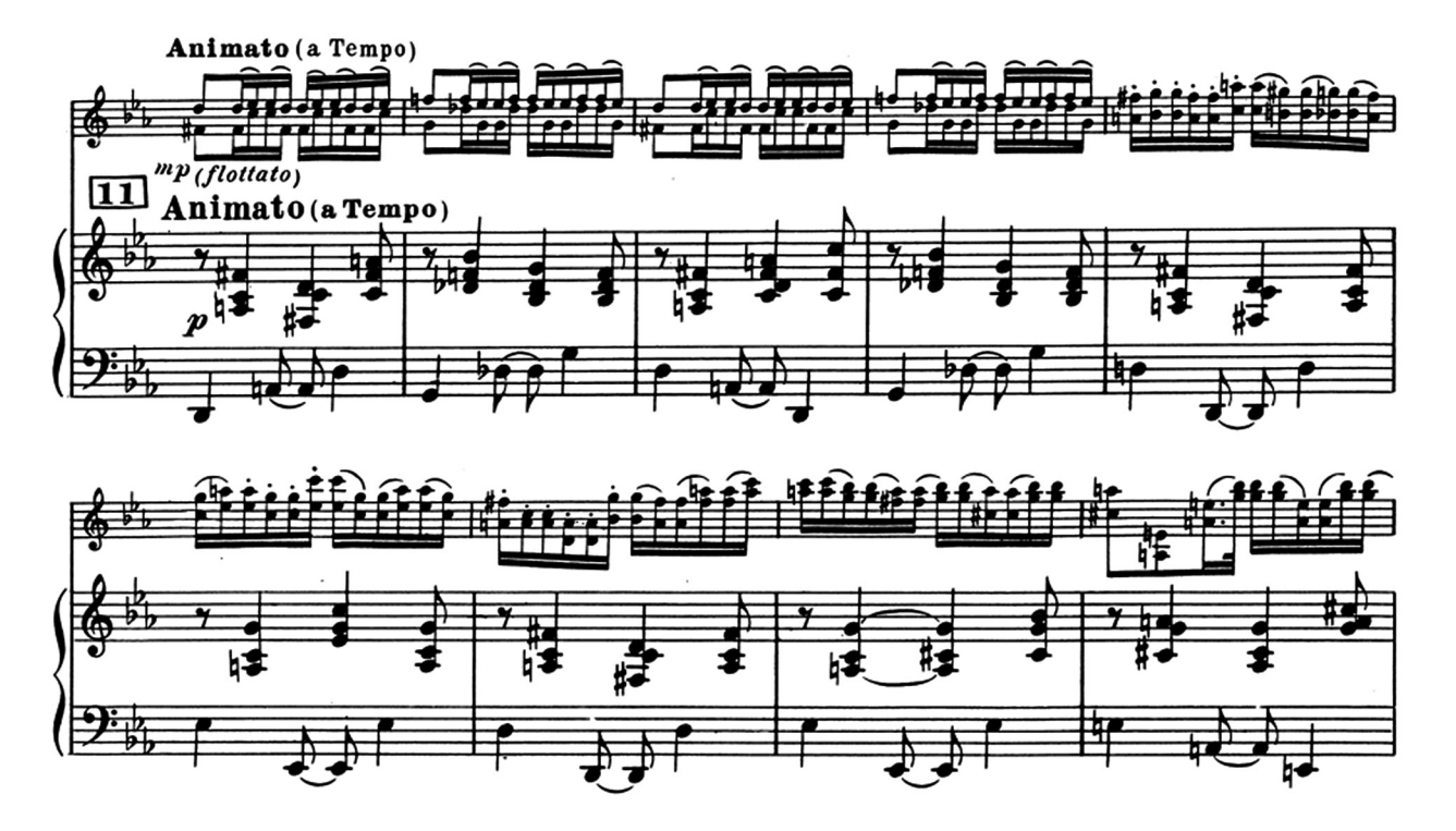
Example No. 3 Episode I, Dance

not have any mutual influences on each other, but are isolated one from another, at the same time, within each thematic sphere there is a continual process of formation of an individual scale of expression occurring. The comparison of the dynamic amplitude and the developmental quality of both of the macro-themes indirectly connected with it reveals a measure of its dramaturgical weightiness in the first half of the form. The E-flat minor theme accumulated the expression little by little, step by step, as if preserving the energy for something more significant; it seemed that it was ready to depart from the preset semantic boundaries, "foretelling" by the shrill declamation of the solo violin the complex trajectory of its compositional "destiny." Unlike the first macro-theme, the second, situated at the basis of the subsidiary theme group, the conclusive theme and the development sections, is oversaturated by textural and intonational metamorphoses, tessiturabased, dynamic descents and ascents, as well as harmonic clarifications and shadings. However, this is particularly what its