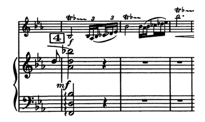
Example No. 6 The Motive of the "Wings," f. 4.

The appearances of the symbolic motive, at first, are rarefied and unobtrusive and for this reason, as it may seem, insignificant in the figurative-substantive direction of the Poème . However, notwithstanding the considerably small-scale summarized scale of sound, they still attract attention by several remarkable peculiarities: