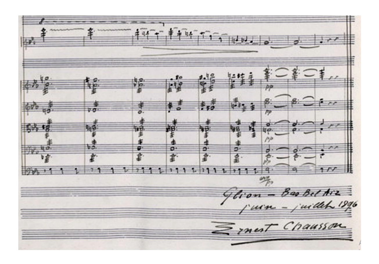
Il. 1. Autograph score of Ernst Chausson's "Poème" for Violin and Piano (ending)

opus 24<sup>19</sup> set to the early poems from the writer's book of poems with the same title.<sup>20</sup>