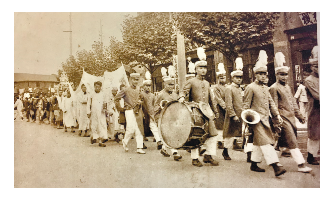
Image 1. Chinese Funeral (The Band and Chief Mourner). Shanghai

videos from WeChat groups [20] that the current village bands are survivals of this older tradition that originally spread by the warlords. Such bands still exist and perform and carry out functions for funerals and public ceremonies.