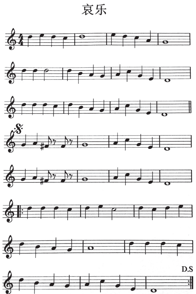
Example 2. 1st B-flat trumpet part for Ai Yue (Sorrowful Music) composed by Luo Lang (1945) transliterated from the jianpu musical notation of the New York Chinatown musicians by the author Joseph S. Kaminski (2015)

Another important military funeral song of the Chinese brass bands is Zangli , which means "Funeral," its full title being Zangli Jinxingqu , literally meaning "Funeral March." It was composed by Li Tongshu in 1947 to commemorate again the war martyrs, and it also was maintained by Chairman Mao as military funeral music. It also may be regarded as the foremost of the Chinese military brass band funeral dirges, for it is performed more often that Ai Yue . Li took