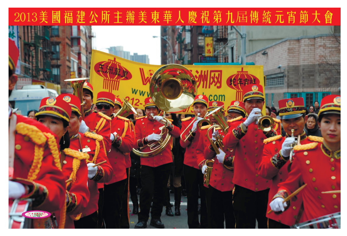
Photograph 7. Hua Sheng Guan Yuetuan performing for the North American Chinese People's 9th Celebration of the Lantern Festival sponsored by the American Fujianese Spring Festival. Chinatown, New York

China's modern military music developed greatly right after World War II with funeral dirges written by Luo Lang and Li Tongshu. The mourning of war martyrs is a Chinese value reminding the Chinese people of the atrocities of imperialist intervention in the country as witnessed in the War of Chinese People's Resistance Against Japanese Aggression. These values are maintained even in New York City honoring Chinese