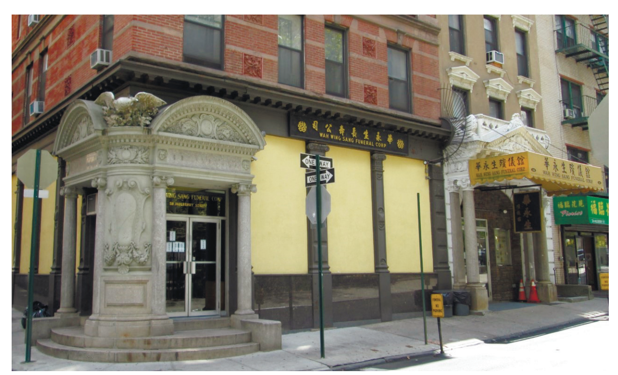
Photo 2. The old Banco di Italia [left] and Bacigalupo Funeral Home [right] in Chinatown, now combined as Wah Wing Sang Funeral Corp. [credit: Joseph S. Kaminski. Mulberry Street, New York, NY, 2013]

A tradition of Italian brass bands performing Christian hymns for Chinese funerals in Chinatown was already firmly established. Two New York Times articles from 1964 [12, p. 11] and 1976 [13, p. 41] include photographs of what they called "The Mulberry Street Band," performing on the street during Chinese funerals. In the 1976 article, one bandsman said, they play "everything from fiestas to funerals," fiestas