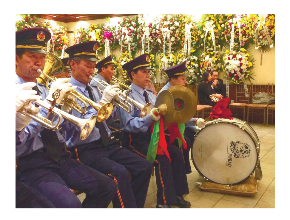
Photo 1. Hua Sheng Guan Yuetuan performing at a funeral. Flushing, New York, 2018

[1; 2; 3; 4; 5]. China was never a colony of Britain, but it maintained international treaty ports [6, p. 241] through which Britain introduced the brass band tradition, first to Shanghai<sup>1</sup>, and later to Tianjin and Beijing [3].<sup>2</sup> The modern Chinese military band came from the Prussian tradition and was taught to recruited Chinese military bandsmen by Prussian band directors, one of them known only as Goldstar.<sup>3</sup>