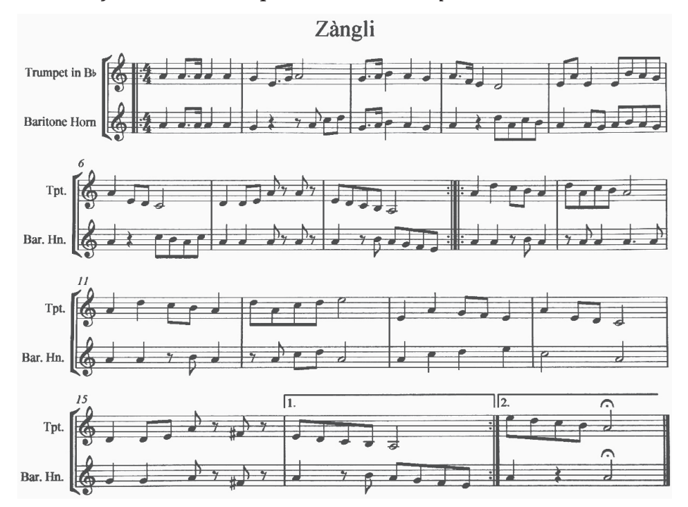
Example 3. Five-line staff notation of Zangli Jinxingqu (Funeral Music) composed by Li Tong Shu (1947) transliterated from the jianpu musical notation of the New York Chinatown musicians by the author Joseph S. Kaminski (2015).

and most played songs, performed at certain points of a funeral. Other Chinese songs maintained by the funeral brass bands are more recent and of a popular or romantic character, very often romanticizing the love of friendship and the world, a premigration value, attitude, and custom from the Motherland, China. Many are from the post-Mao decades, including songs of filial piety. Thus, important songs normally performed in the chapel for a decedent before a ceremony are Fuqin (Father) (c. 1992) written by Che Xing and Qi Jianbo, and Muqin (Mother) (c. 2004), also written